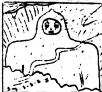
*an INFINITY Hall-of-Fame Ad- venture, from File.

EXCLUSIVE INTERVIEW WITH ON-THE-SPOT INVESTIGATOR REVEALS INTERESTING FACTS . . .