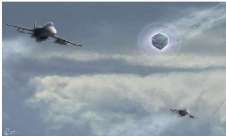
Indeterminate, piloted or unpiloted drones depending on size.

Sometimes with sightings of UAP it is fairly easy to classify them, except in cases where one doesn't know if the object is large enough to contain a passenger or pilot. A good example of which is the dark cube in a translucent sphere described by FA-18 pilot Ryan Graves in April 2014. This then is our example of a Type 4, the Indeterminate. Another group consists of reports of lights observed at night. These are also capable of high speed and acceleration. They are less commonly seen in groups. They usually appear to be sharply defined luminous objects. But we have no way of knowing which ones are piloted or remote-controlled.