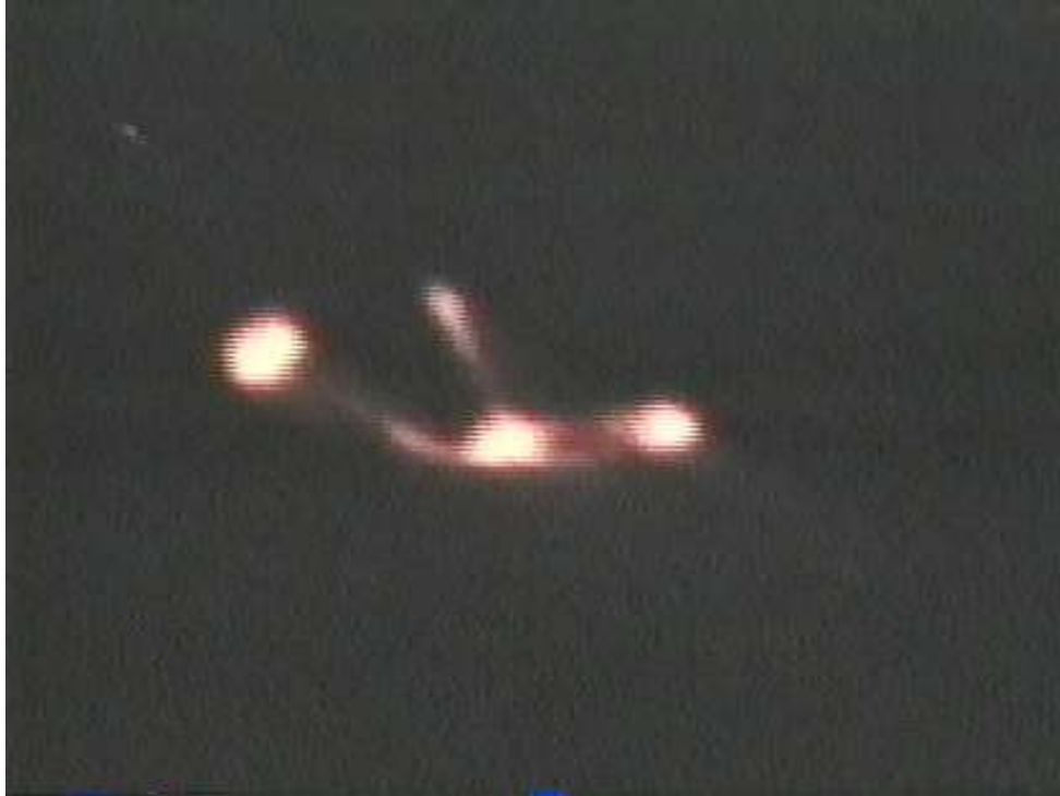
Sept. 20, 1973, massive craft in orbit near Skylab-III https://www.nicap.org/730920skylabIII_dir.htm

During the Gulf War the U.S. Army used the AH-64 Apache and AH-1 Cobra attack helicopters to fire laser-guided missiles at tanks. Other helicopters used in the war included the Sikorsky UH-60 Black Hawk, Bell OH-58 Kiowa, and Mil Mi-17. The U.S. Navy, Marine Corps, and Army used the Pointer and Pioneer drones. The Pioneer drone had a range of about 100 miles and a flight duration of five hours. The E-3A Airborne Warning and Control Systems provided situational awareness and targeting data to U.S. air units. The Coalition air fleet used B-52 Stratofortress bombers. The F-15C Eagle was responsible for the majority of air to air kills during the war. The U.S. Air Force used F-15Es and F-16s in the war. The F-117a Stealth was also used in the war. And who can forget the Navy's Tomahawk Cruise Missile? These are just a few of the items used during Desert Storm.