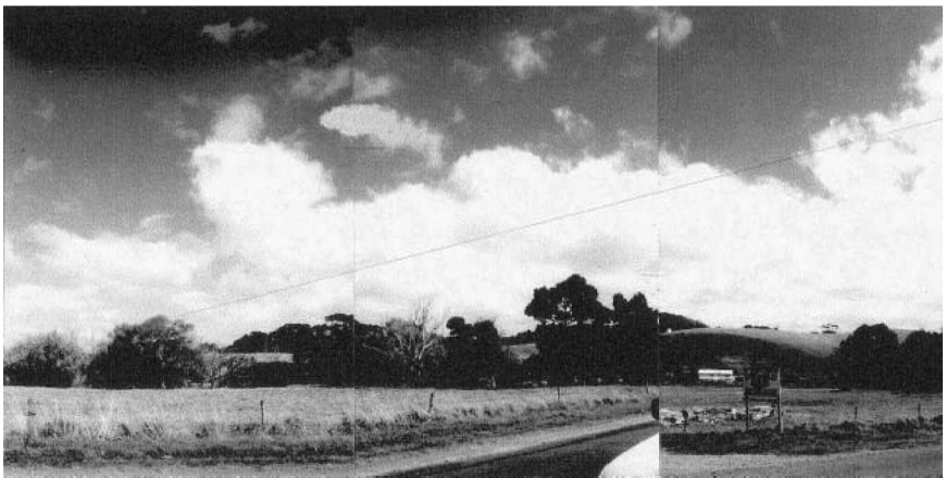
Fig. 3. Three contiguous photographs of sighting area (from 126 to 200^\circ magnetic bearing).

Figure 3 is a photo-collage taken by author R.H. at the three locations along Barham Valley Road referred to in Figure 2. Mr. Hansen said that it was so dark, he was barely able to make out the tops of the trees and hill against the southeast sky. Both the airplane and accompanying light (which appeared to fly in parallel with the Cessna) seemed to descend at an apparent 30 to 40^\circ angle (above the horizontal) along a straight line approximately as shown by the dashed line in Figure 3. Both lights eventually disappeared behind the hill-top at a magnetic bearing of about 126^\circ from Hansen's location (left section of Figure 3). No sounds were heard coming from the direction of the lights at any