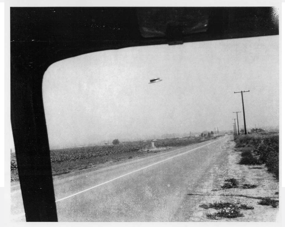
FIGURE ONE: HEFLIN'S FIRST PHOTO, FROM FRONT WINDOW OF HIS WORK VAN.