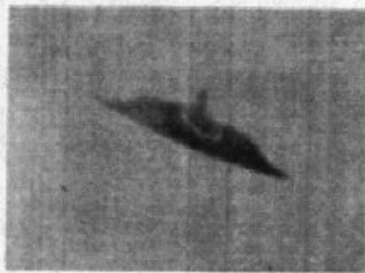
UFO photographed over Rouen in March, this year. Photos of UFOs are rare, never very clear. This is one of the few which seem authentic.

There have been many other nonsense sightings. Again in 1954, a