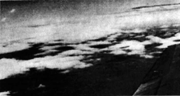
Shining discs (in left-hand top corner) seen by Scandinavian scientists in 1954. Still from a colour film taken by a member of the party

group of Scandinavian scientists were returning by air after observing an eclipse of the sun from the polar regions. They were on their way back, but still taking photographs of the sun, when their attention was taken by something else. Several shining disc-like objects appeared to be shadowing their aircraft. What they were, none of the scientists knew. They were no aircraft such as we know them and none of the scientists on the trip had ever seen anything like them.