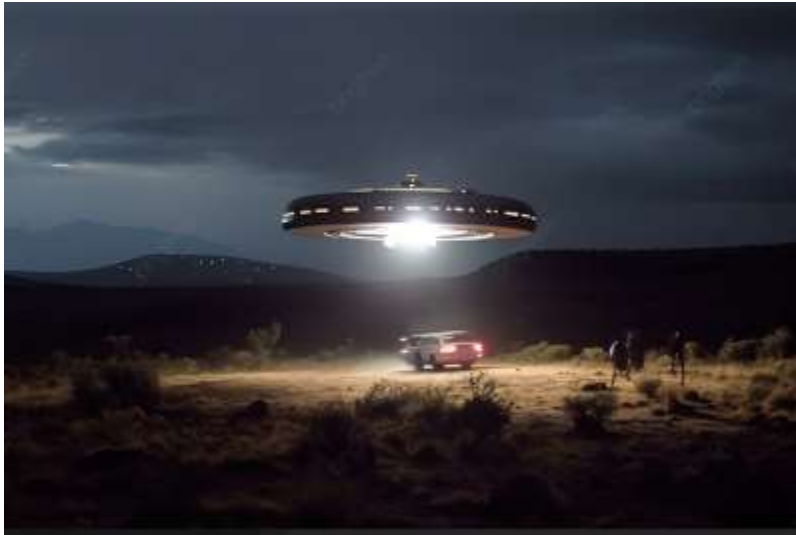
Artist rendition of encounter at Clarksburgh

It is a story we have heard time and time again. It's the wee hours, 1:57 a.m. (EDT). A young couple was traveling home from an evening out and were startled to encounter a huge cigar-shaped craft hovering in front of them, approximately 30 feet off the ground. It was emitting a sort of rainbow colored light arrangement and a low audible buzz or humming sound associated with it. As the couple approached in their vehicle it seemed to notice their presence and shined a bright bluish green light directly at them. The craft didn't seem threatened by their presence, but apparently it was aware of them being there. After possibly 3-5 minutes the craft shot up to a few hundred feet and took off in a northeasterly direction. No sound was heard as it propelled itself forward,